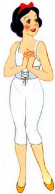
PRINCESS SNOW WHITE

Punch out these Disney Princess paper dolls and assemble the stands as shown. Then punch out the gowns and have fun dressing the princesses for a wedding, a royal ball, or an evening with a handsome prince!